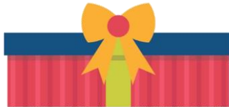
gift box 128cm