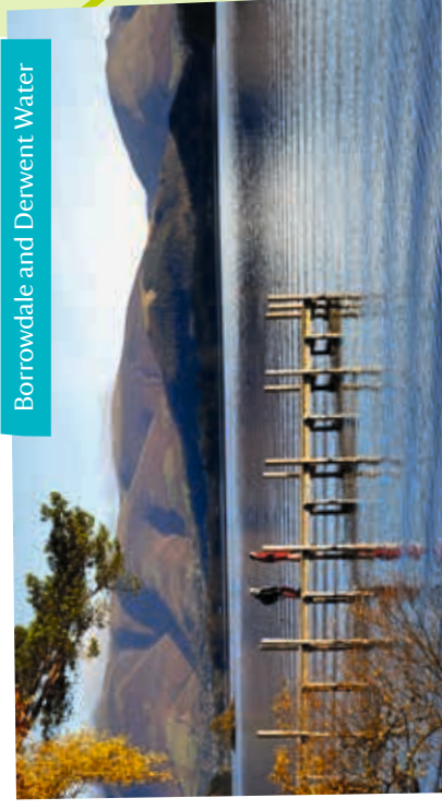
Borrowdale and Derwent Water