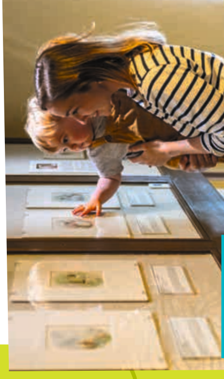
Beatrix Potter Gallery

Hawkshead shop open until 31 December, closed 24 to 26 December