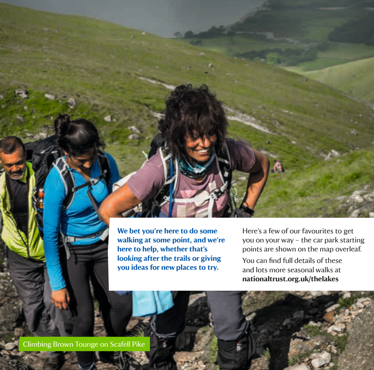
Climbing Brown Tounge on Scafell Pike

You've got the boots, we've got the routes