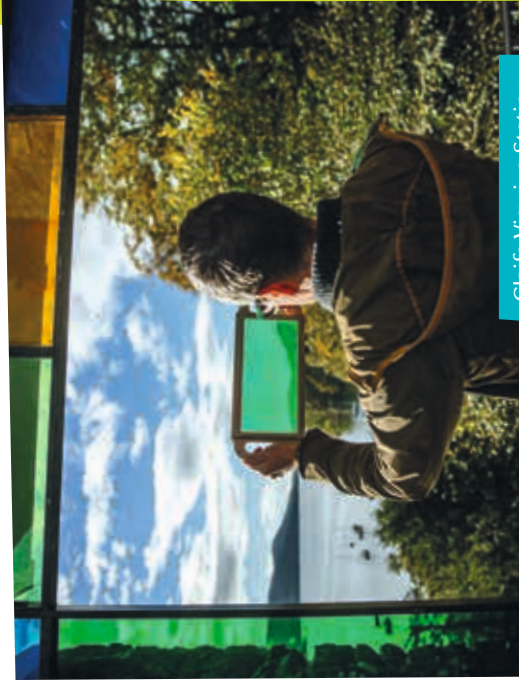
Claife Viewing Station

You can hire bikes from our campsite on the lakeshore or try all sorts of water sports at Fell Foot. Or, simply wander through the woodland up to the Georgian viewing station for incredible lake and mountain views changing dramatically with each new season.