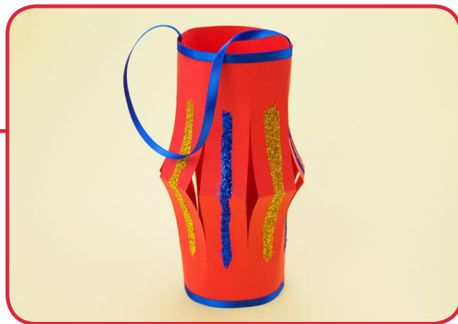
A4 Coloured Card